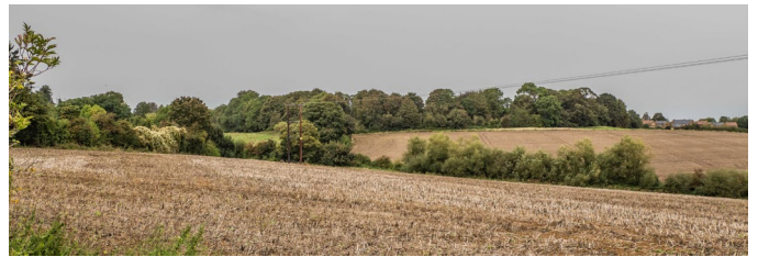
12a. From Chapmans Lane, north to Deddington Castle earthworks