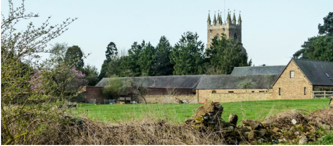
9. From Earls Lane, south-west to church tower