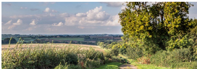
3a. From Cosy Lane, north across the Swere Valley