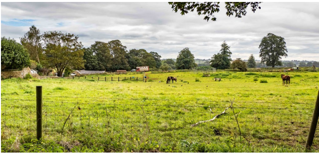
14b. From start of Grove Fields footpath, south towards Duns Tew