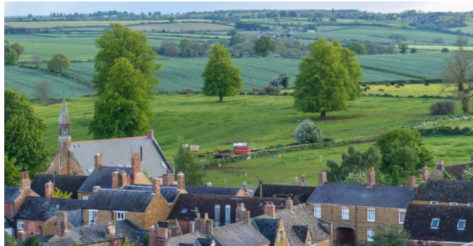
West from church tower