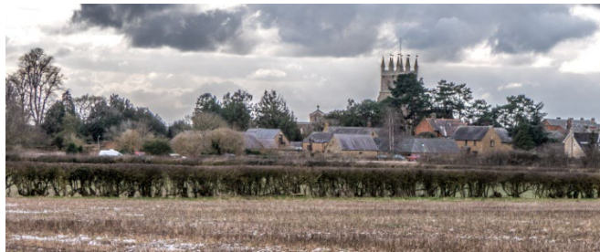
11. From Green Hedges Lane, south-west to church tower