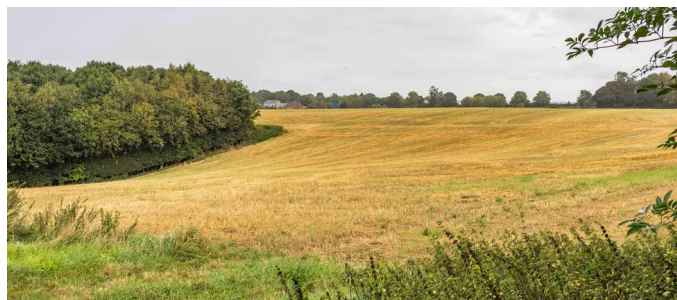
3b. From Cosy Lane, north-east to Kings Spring Field