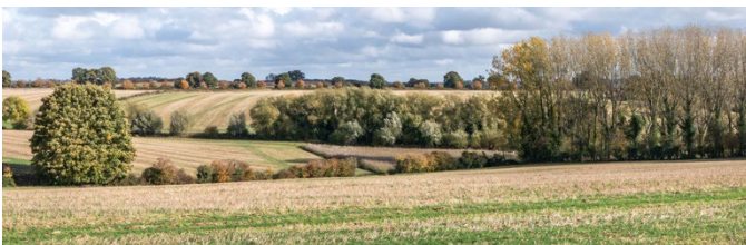
12b From Chapmans Lane, north-east towards Clifton