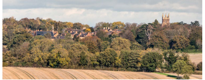
Church from North Aston