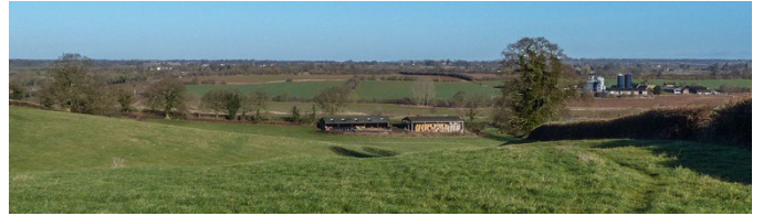
10. From Green Hedges Lane, north towards Adderbury