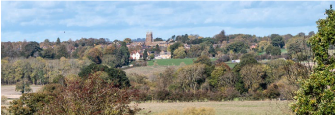
Church from Duns Tew