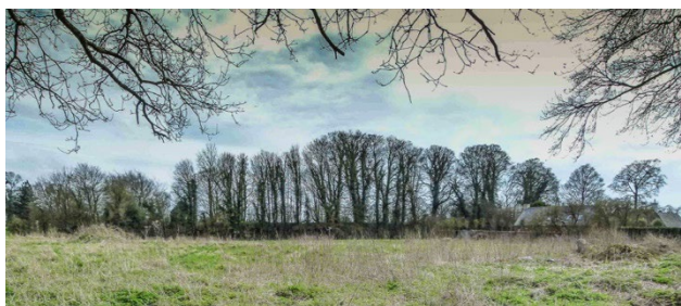
5. From Clifton Rd, south to Deddington Castle earthworks