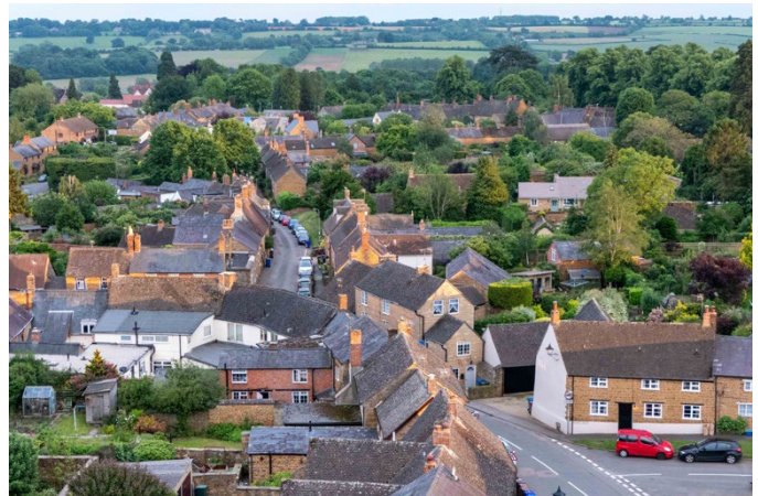
South from Church Tower