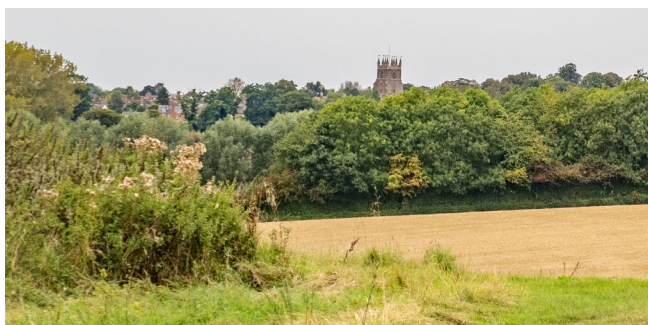
7. From Jerusalem Lane, north-west to church tower