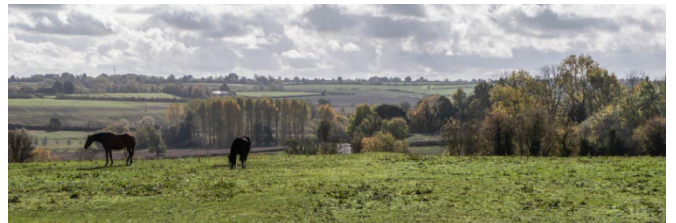
12c. From Chapmans Lane, south to North Aston