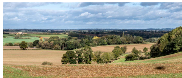
4a. From Hempton Road, north across the Swere Valley