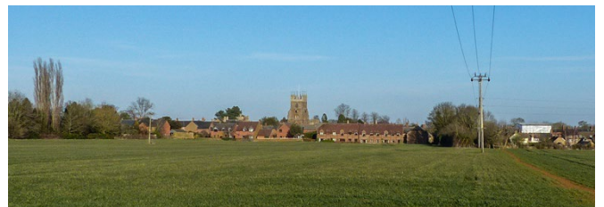
14a. From Grove Fields, east to church tower