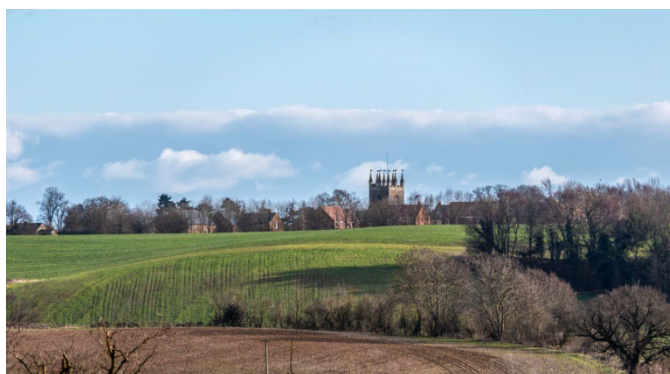
13. From Coombe Hill, south-east to church tower