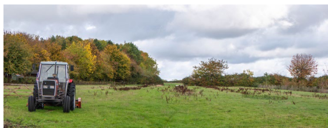
8. From Earls Lane, north to woodland