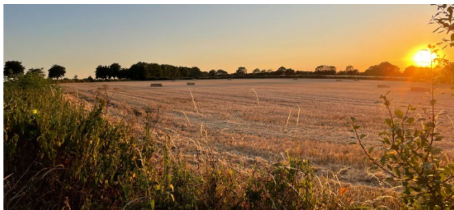
1. From Duns Tew Road, Hempton west to Chipping Norton