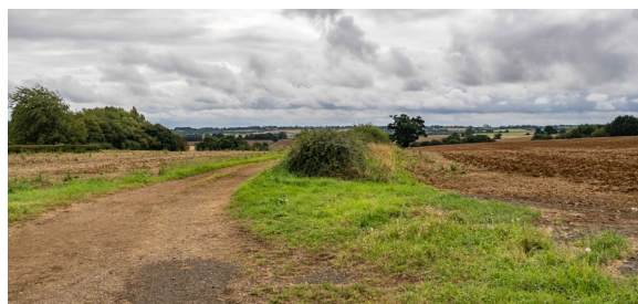
4b. From Hempton Road, south to Duns Tew