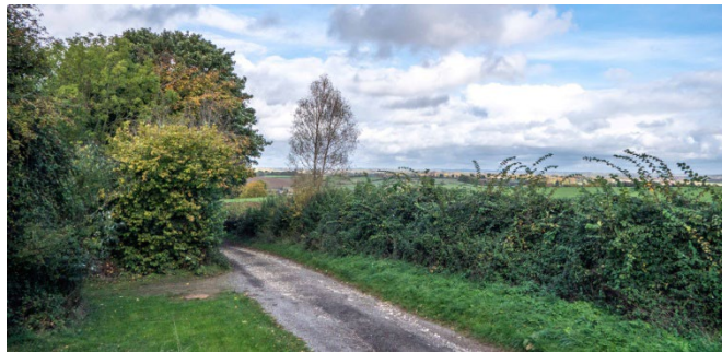
2. From Snakehill Lane, Hempton, north-east to the Swere Valley