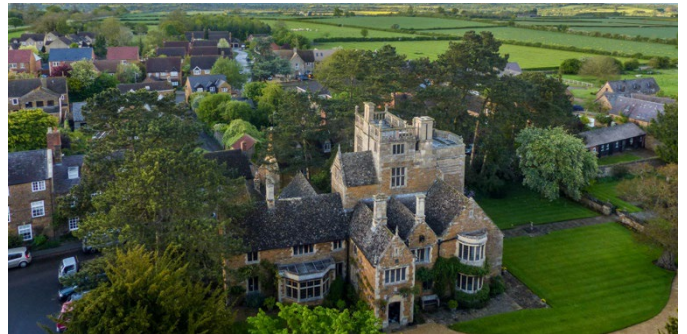
North from Church Tower